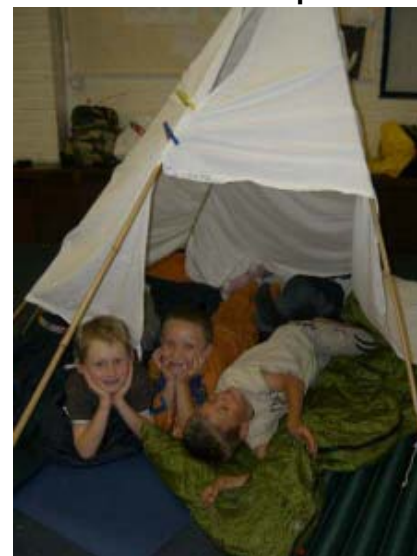
The picture above shows Mudeford Beavers enjoying their Indian sleepover which was held recently.